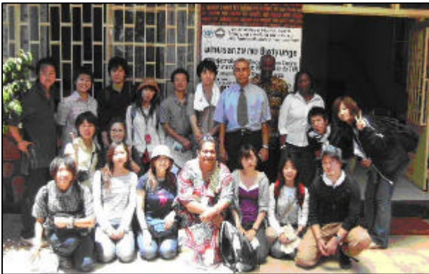
Students of Waseda University pose with staff of the Umusanzu Centre