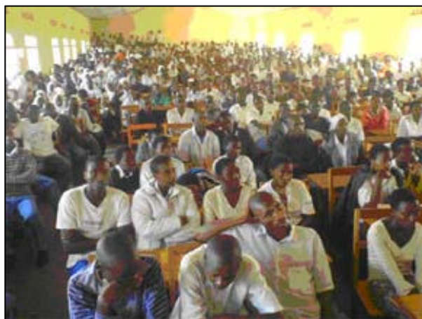
Students listening attentively during one of the awareness workshops in Rwanda

The activity was conducted from 11-14 September 2006 by the Staff of Umusanzu Information Centre. The beneficiaries included three Schools; St. Joseph's Secondary School, Shyogwe college and GS Nyabikenke.