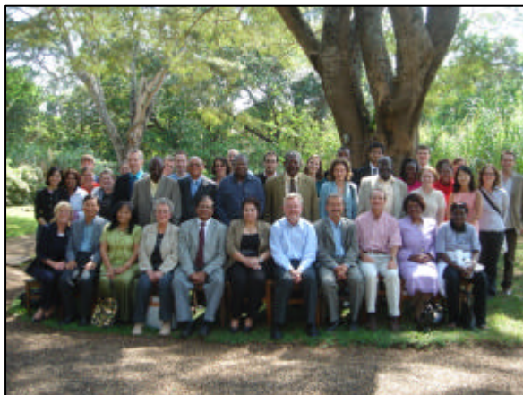
Participants at the Colloquium

The colloquium commenced on Saturday with a seminar on the recent developments in Law of Genocide. This was followed by a seminar on the relationship between International Humanitarian Law and International Criminal Law in repressing war crimes. The day concluded with discussions on forms of criminal participation, including Complicity, Joint Criminal Enterprise, and Command Responsibility. On Sunday, the professors led a round table discussion on the relationship between international tribunals and reconciliation techniques as forms of transitional justice.