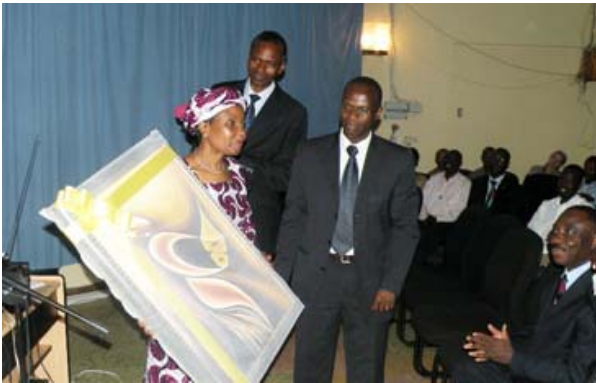
DSG receiving a gift from the UN Federation of Staff Associations