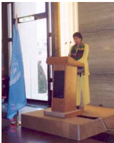
Judge Navanathem Pillay speaking at the Exhibition