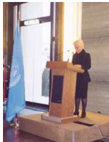
The Prosecutor, Carla del Ponte

From 17 March to 4 April 2003, the Tribunal held a very successful exhibition and a series of round-table discussions on the theme “ The ICTR: Challenging Impunity ” in Geneva, Switzerland, where the UN Commission of Human Rights was conducting its 59 th annual session. The exhibition was part of ICTR’s Outreach Programme for the Rwandan population and the international community.