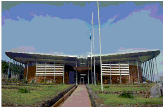
The Special Court for Sierra Leone Courthouse