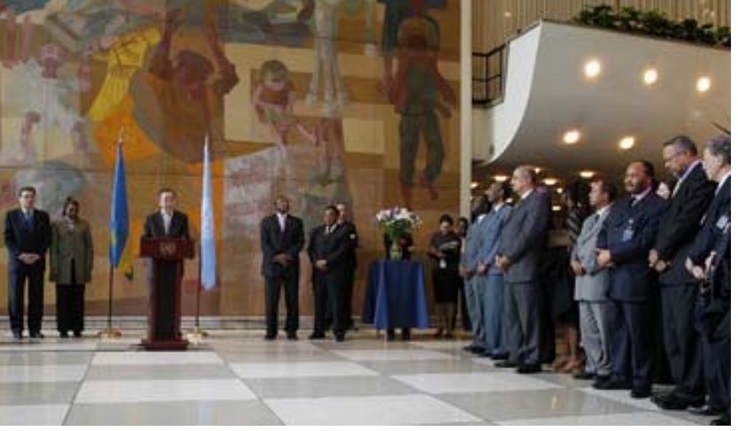
Secretary-General Ban Ki-moon addresses a ceremony in observance of the fourteenth anniversary of the genocide in Rwanda, at UN Headquarters