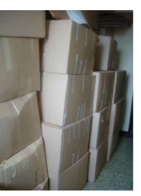
Boxes of investigation records

When a staff was separating from the office or transferred to Arusha, the files left were just put in cartons and the office cleaned for the next occupant of the office.