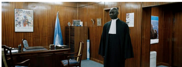
The International Community and the Prevention of the Rwandan Genocide