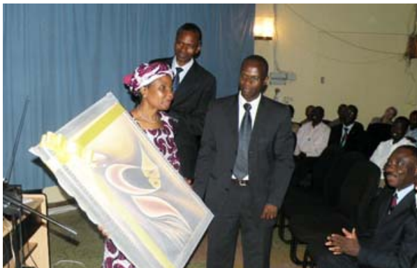
DSG receiving a gift from the UN Federation of Staff Associations