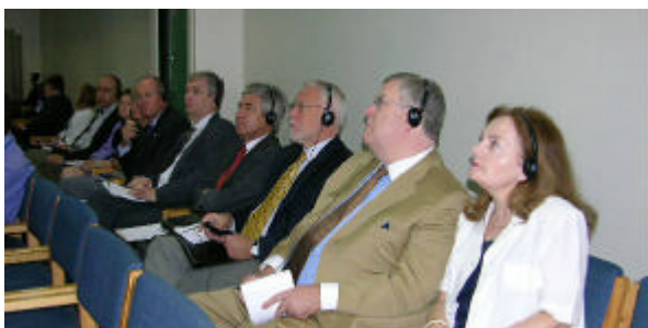
The Delegation attends a court session