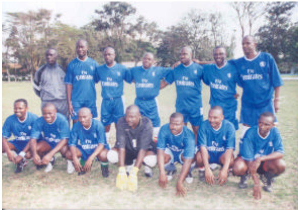
ICTR Arusha Team