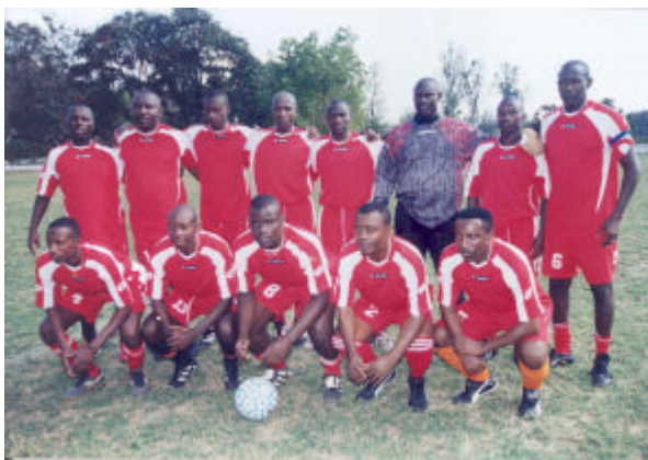
The Victors, ICTR Kigali Team

Other sporting events that took place on Saturday 22 October at the St. Constantine School grounds were: Table Tennis, Volleyball, Petanque, Darts and Football. It was the second time that the ICTR Arusha football team was playing against their Kigali counterparts. The Kigali team won the match, three goals to one.