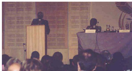
Rev. Desmond Tutu, Archbishop of Cape Town (on the podium) with Sir Ketumile Masire, the former President of Botswana, looking on

The conference was official opened by Dr Ben Ngubane MP, Minister of Arts, Culture, Science and Technology of South Africa. Keynote addresses were given by Sir Ketumile Masire, the former President of Botswana, and Rev. Desmond Tutu, Archbishop of Cape Town and former head of the Truth and Reconciliation Commission of South Africa. Both spoke on the importance of archival legacies of courts and the need to fully document human rights abuses in our efforts to halt the rule of impunity.