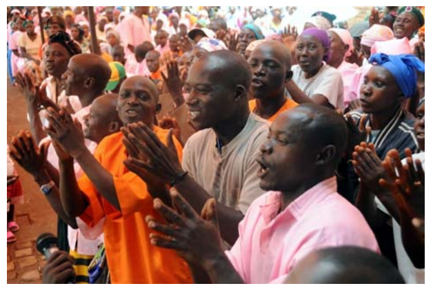
Prisoners from one of the major prisons in the country singing unity and reconciliation songs during the ICTR - DPI organized events.

The 2012 program in prisons, included lectures and debates on the history of the Rwandan conflict, more particularly the 1994 Genocide against the Tutsi's; screening of ICTR documentary film "Justice today, peace tomorrow" and also the distribution various Tribunal publications, as well as the "Tugire ubunwe publications", a cartoon book produced by UNDPI with the main objective of educating Rwandans on the: history of genocide, its causes, how to fight its ideology and support the unity and reconciliation process in the country.