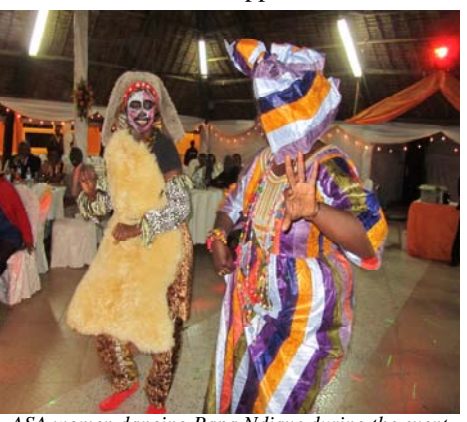
ASA women dancing Papa Ndiaye during the event

foreign cuisine was honored as Niara, Fonyo and Kebab all answered: "present". As if their hospitality was not enough, guests had not dealt with their