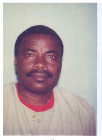
CallixteNzabonimana, Minister of Youth and Member of MRND

mune, Gitarama préfecture, Rwanda. During the events of April to July 1994, Nzabonimana served both as the On 1 November 2010, Trial Chamber II of the Tribu- Minister of Youth and Associate Movements in the nal convicted Kanyarukiga of genocide and extermi- Interim Government and as the chairman of the MRND