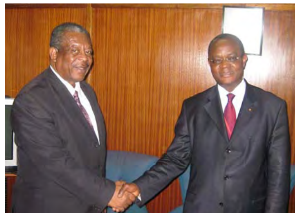
Judge Byron with HE Koffi Esaw

His Excellency, Koffi Esaw, Minister of Foreign Affairs and Regional Integration of the Republic of Togo visited the Tribunal from 3-4 May 2010. The purpose of the visit was to familiarize himself with the operations and resources of the Tribunal and to learn from the ICTR's multifaceted achievements and challenges within the framework of its completion strategy.