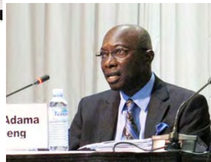
Mr. Dieng addressing the Conference

with Offices in The Hague, Accra, Ghana and South Africa] dedicated to the Review Conference, Mr. Adama Dieng hailed the Africa Legal Aid for their relentless efforts to make African issues visible on the international agenda in positive light. Drawing on Africa's oral tradition, Mr. Dieng challenged African legal practitioners and scholars to take writing more seriously in order to demystify and render void some of the very negative stereotype opinions about Africa and the African people.