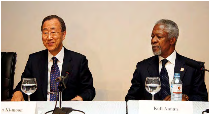
Secretary-General Ban Ki-moon (left) and former UN Secretary-General Kofi Annan attend the first Review Conference of the Rome Statute of the International Criminal Court (ICC), in Kampala, Uganda.

From 31 May-11 June 2010, over 2500 delegates comprising of Judges, Legal Practitioners, Academics, Diplomats, Politicians, Civil Society, Regional and International Non-Government Organisations, Religious Leaders, and victims of international crimes thronged a little resort on the shores of lake Victoria in Kampala, Uganda for the Review Conference of the Rome Statute of the International Criminal