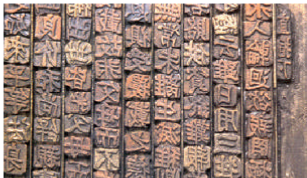
Second volume of the Jikji manuscript

Buljo Jikji simche yojeol (referred to as Jikji) is the world's oldest text printed with metal type. Printed in 1377, it predates by 78 years the Gutenberg Bible of Germany. Jikji, was printed at Heungdeoksa Temple in Cheongju, Chungcheongbuk-do province, Korea. Jikji is a collection of Buddhist treatises and teachings compiled by the monk Baegun (1298-1374). It contains abstracts from the eulogies, songs, precepts and dialogues of great Buddhist monks and is intended for the instruction of Buddhist ascetics. Jikji simche is taken from a Buddhist writing and means "when you meditate and see truly into a person's mind is when you come to know the mind of the Buddha."