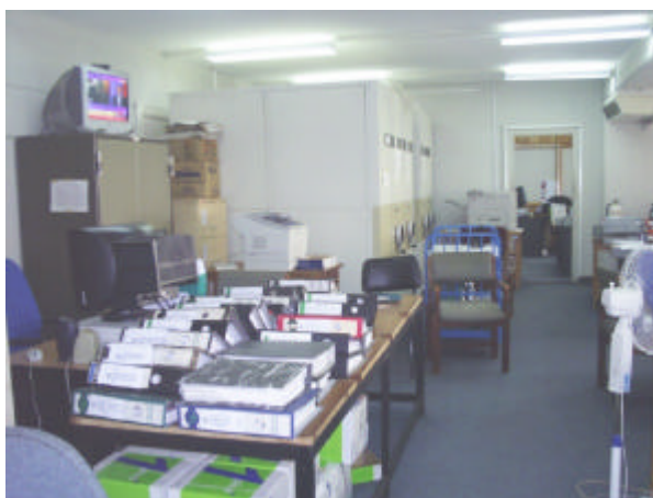
Judicial Archives of the ICTR

The ICTR Judicial Archives has been short-listed amongst 7 others of the total of 36 submitted nominations for this prestigious international prize. The 7 short-listed nominees for this first-ever UNESCO/Jikji Memory of the World Prize were selected for significant contributions to the preservation and accessibility of documentary heritage of international significance.