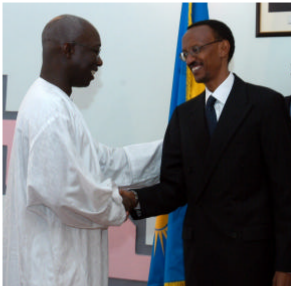
Mr. Adama Dieng and President Paul Kagame

The Registrar of the International Criminal Tribunal for Rwanda, Mr. Adama Dieng, met the Rwandan President Paul Kagame on Thursday 24 March 2005. The purpose of the visit was to brief the Rwandan leader on the tribunal's completion strategy that involves the transfer of some of the genocide cases to the country's judicial authorities for trials to be carried out there. In addition the Registrar and the President discussed the good bilateral relations existing between the Rwandan government and the UN Tribunal. On the transfer of cases, Mr. Dieng said the agreement was ready and was only awaiting the United Nations Justice Council signature and approval to transfer the cases. He further said that the completion strategy had already been developed and presented to the UN Security Council.