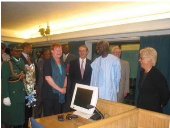
President Halonen seen here with, among others, Mr. Adama Dieng, Ms Carla del Ponte and Judge Erik Mose

The revised estimates requested from the General Assembly for 2003, arising in respect of Security Council resolution 1431(2002) of 14 August 2002 for the use of a maximum of four ad litem Judges in the International Criminal Tribunal for Rwanda, would amount to $5,060,100 gross ($4,605,400 net) with an additional 32 temporary posts. This will bring the total resource requirements of the Tribunal for 2002-2003 to $204,365,100 gross ($183,224,000 net).