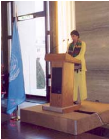
Judge Navanathem Pillay speaking at the Exhibition