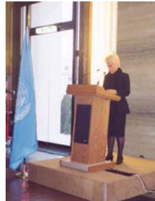
The Prosecutor, Carla del Ponte

From 17 March to 4 April 2003, the Tribunal held a very successful exhibition and a series of round-table discussions on the theme “ The ICTR: Challenging Impunity ” in Geneva, Switzerland, where the UN Commission of Human Rights was conducting its 59 th annual session. The exhibition was part of ICTR’s Outreach Programme for the Rwandan population and the international community.