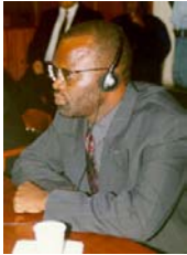
Kambanda, Interim Prime Minister

The Tribunal has apprehended and detained 65 persons so far out of approximately 80 persons indicted to date. These detainees were apprehended in about 22 different countries outside of Rwanda. The Tribunal therefore has a strong record of arrest of indicted persons. Arrested persons (including some of those convicted) include the Prime Minister of the Interim Government of Rwanda during the genocide, 11 Ministers of that Government in 1994, senior officials of the military and the clergy.