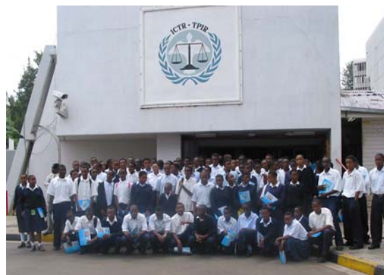
A group of students visiting from the Edmund Rice School

Moreover, growing political support and interest in the work of the Tribunal has been manifested by increased visits to the sites of the Tribunal. In Arusha, 1179 visitors came to the seat of the Tribunal as part of 107 delegations in 2002. These