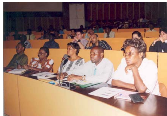
ICTR general staff meeting with the Registrar

However, given the significant number of persons in detention awaiting trial, the current heavy case load of the judges and anticipated future arrests of indicted persons, more than four additional judges are necessary, to be based in Arusha at any given time, if the Tribunal is to complete its task of trying these individuals without undue delay. It will be recalled that 27 ad litem judges were elected for the ICTY in 2001 and they were allowed the possibility of having nine at any given time. The Tribunal’s completion strategy, which envisaged completion of trials at first instance by 2008, was based on a scenario where the Tribunal has nine ad litem judges deployed at any one time with appropriate support resources.