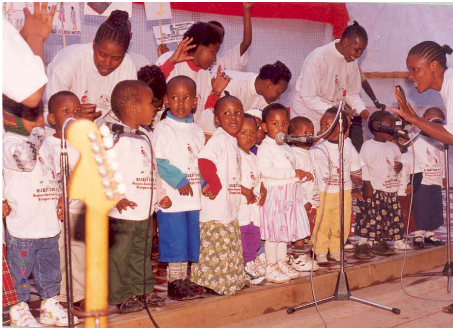
Visit to the Usa River Orphanage with gifts for the children donated by ICTR staff