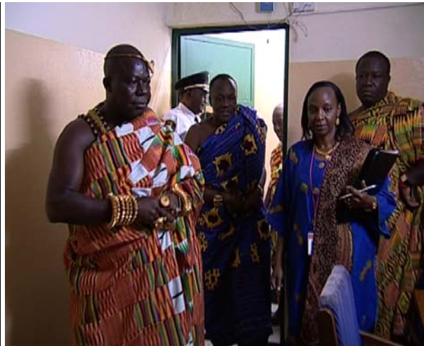
The King and his entourage with the Chief of DASS

She pointed out that the fight against impunity cannot be won without the involvement of all stakeholders and thus invited the King, to join the fight against impunity and, more precisely, the fight against all forms of discrimination against women.