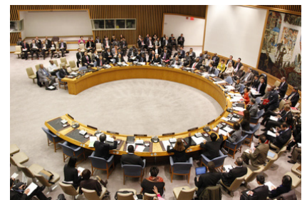
A UN security council session

ICTR is required to close its first instance trials by the end of 2011.