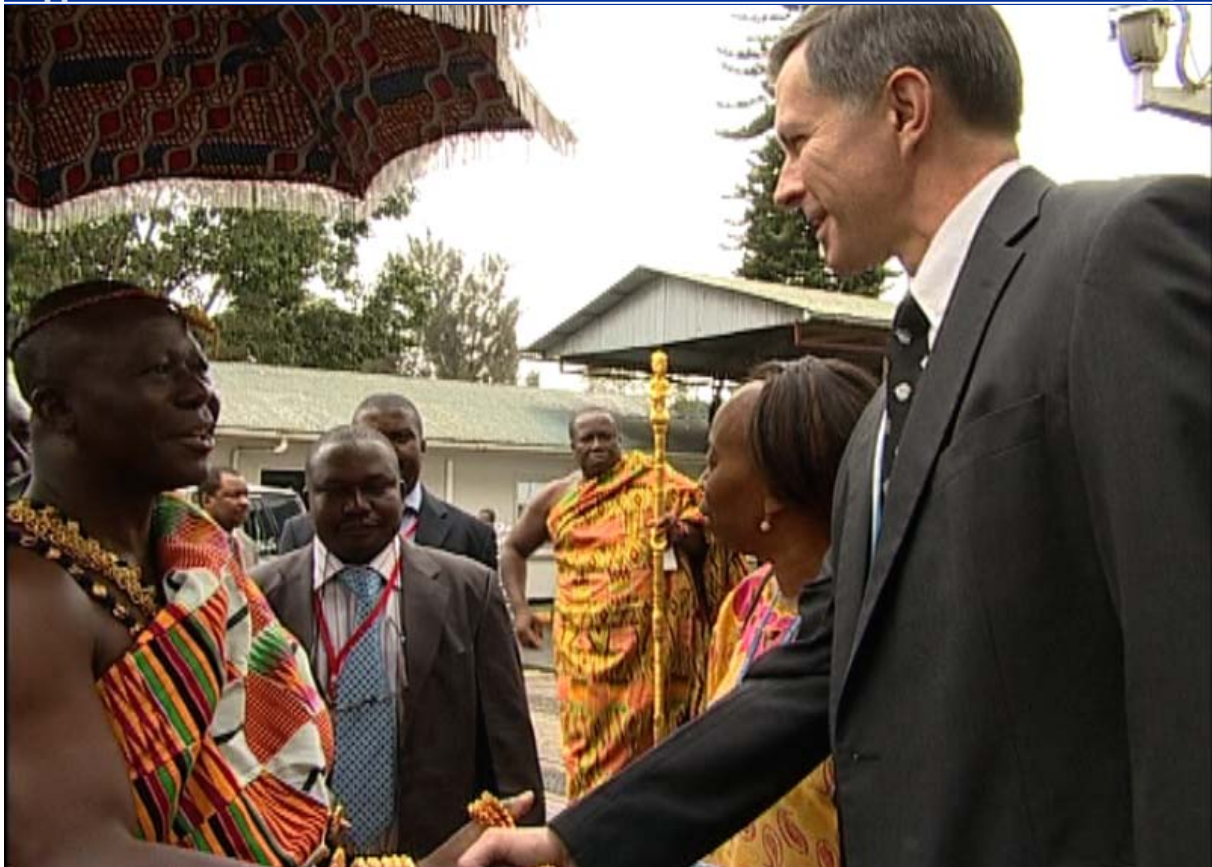
King Otumfuo Osei Tutu meets with the OIC Deputy registrar Pascal Besnier