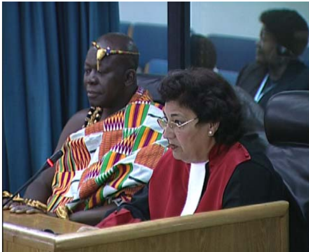
The King meets with the ICTR President