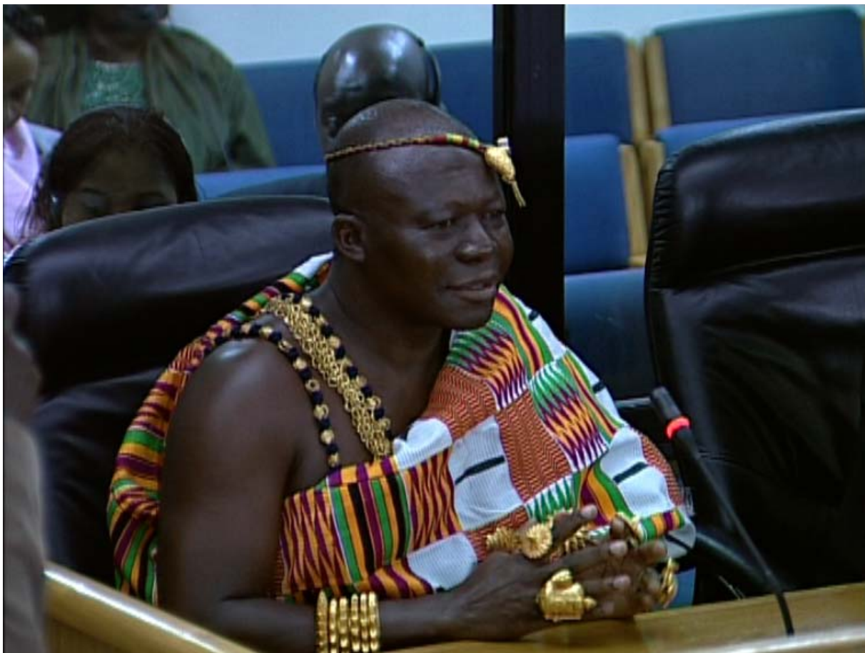
The King's address