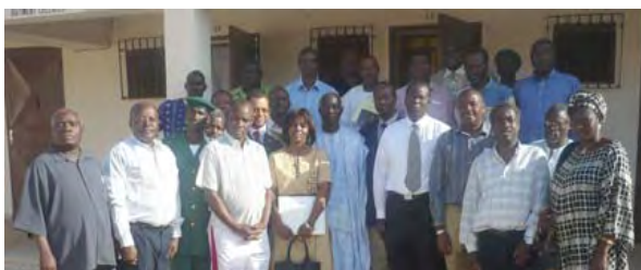
The Delegation with the ICTR Convicts in Mali