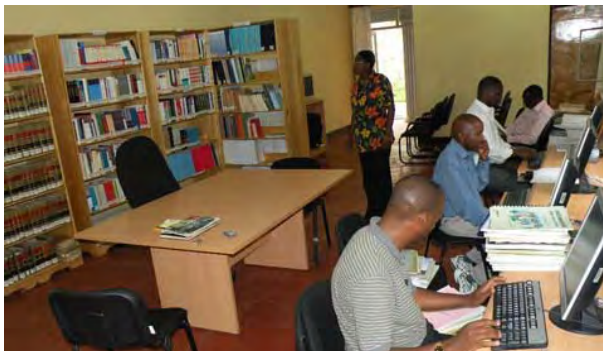
Karongi Information Centre

Having catered for the Kigali population through its main Information Centre; "Umusanzu mu Bwiyunge", (which translates as "a contribution to reconciliation") the Tribunal decided to expand its outreach coverage to the ten regions with financial support from the European union.