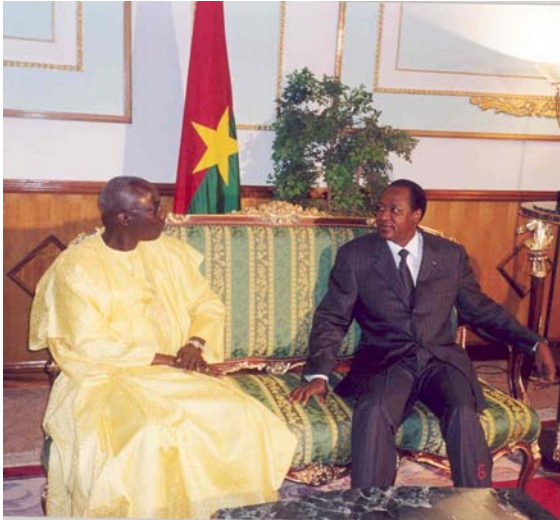
The Registrar with His Excellency Blaise Compaoré, President of the Republic of Burkina Faso

Responding to the Registrar's appeal for support, the Heads of State of Burkina Faso, Mali and Senegal