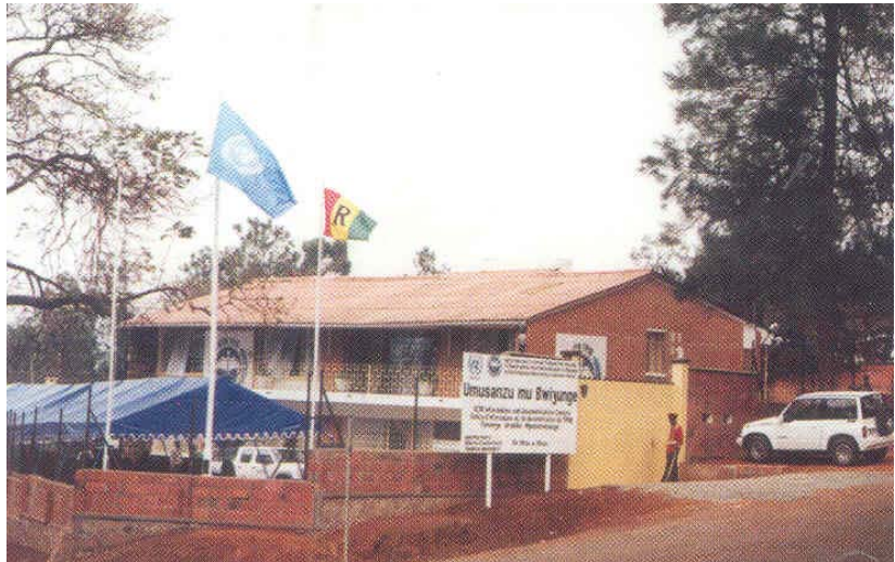
Umusanzu mu Bwiyunge, ICTR Information and Documentation Centre, Kigali