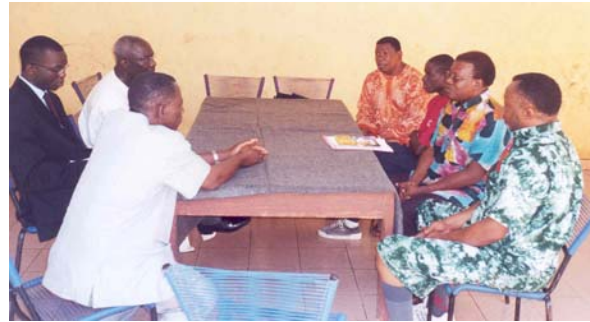
Working session with ICTR prisoners in Mali

The ICTR delegation provided in-depth briefings to the respective Authorities of these West African States regarding the progress of the ICTR judicial activities and the challenges to be overcome in order to achieve a successful completion of its mission in the next five to seven years. The Registrar made an urgent appeal for