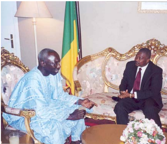
The Registrar with His Excellency Amadou Toumani Touré, President of the Republic of Mali

In the meantime, the Government of Senegal agreed in principle to follow the precedent set by the Republic of Mali in the area of enforcement of sentence handed down by the ICTR. It is hoped that the Republic of Burkina Faso will also follow.