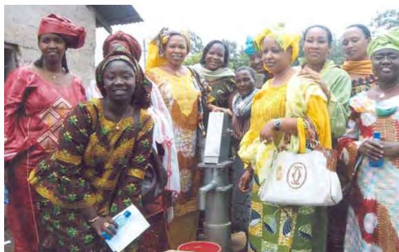
Members of the ASA

This initiative was hailed by the community and all those who spoke at the ceremony, as a project touching directly on the lives of the poor. Due to the interest generated by the project both from within and outside the community and considering the fact that there are several other communities in Arusha in need of clean water supply, ASA has decided to henceforth dedicate all funds raised for water projects in different localities in Arusha.