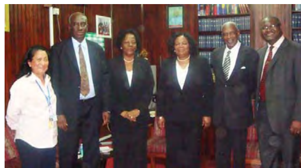
Chief Justice of Sierra Leone and members of the Judiciary with the ICTR/SCSL delegation