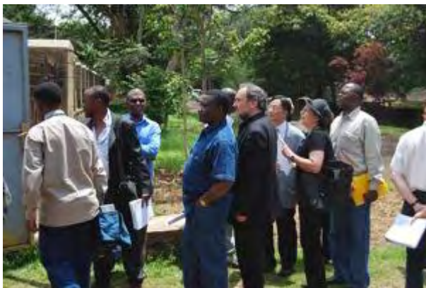
Outside the Former Residence of Prime Minister Agathe Uwilingiyimana

On Tuesday 14 April 2009, the delegation visited the Camp Kigali, RECCE headquarters, the Armoury, the