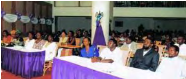
Participants at the Commemoration in Arusha