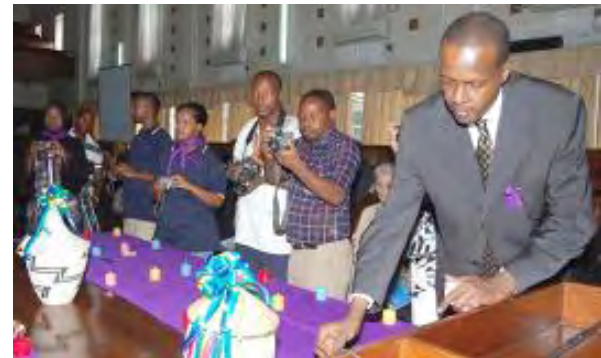
Lighting a candle in memory of the victims