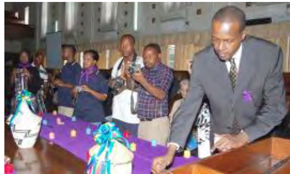
Lighting a candle in memory of the victims