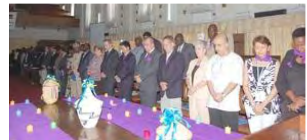
Observing a minute of silence

The well attended event took place at the Karimjee Hall on 7 April 2009 beginning 15:00 hrs. It was attended by senior Government and NGO officials, diplomats, academicians, students and members of the public.