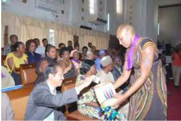
Contributing to the "One Dollar" Campaign