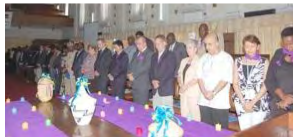
Observing a minute of silence

The well attended event took place at the Karimjee Hall on 7 April 2009 beginning 15:00 hrs. It was attended by senior Government and NGO officials, diplomats, academicians, students and members of the public.