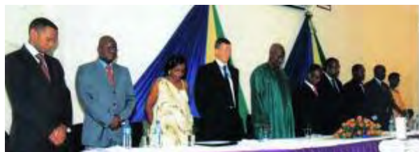
Observing a minute of silence

On 7 April 2009, at Naura Springs Hotel, members of the local and international community living in Arusha commemorated the 15th anniversary of the Genocide against the Tutsi, an event which was organized by the Rwandan Diaspora in Arusha under the theme: "Let's keep alive the memory of Genocide against Tutsi by fighting its revisionism and negationism" .