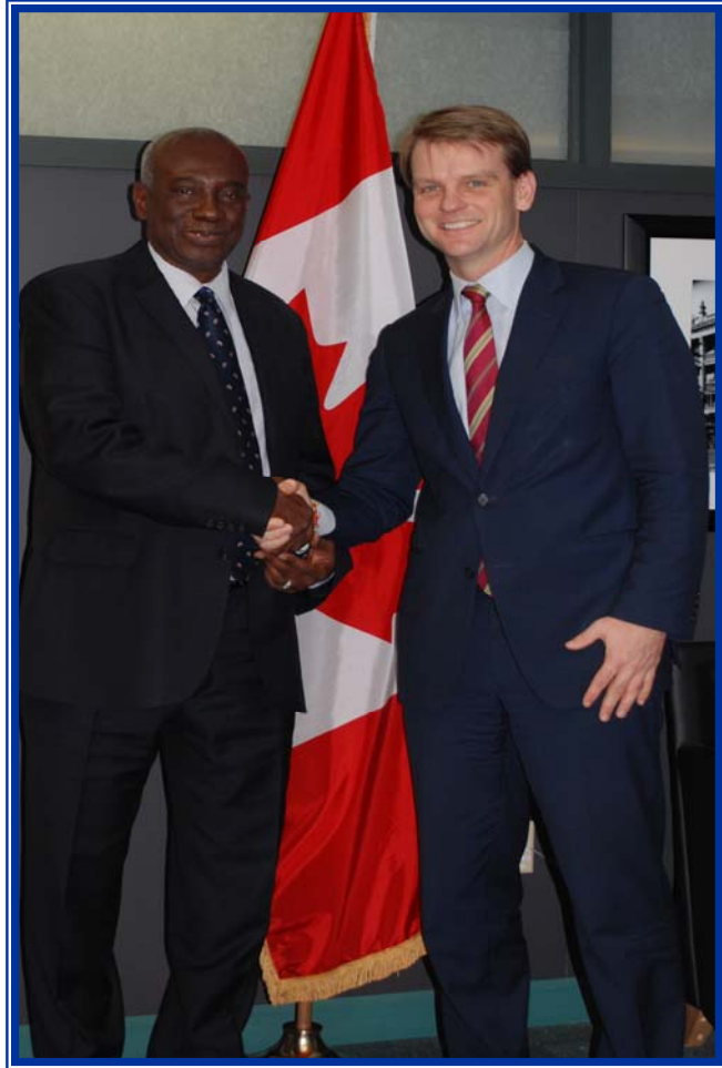
Above: Meeting with the honorable Chris Alexander, Minister for immigration and Citizenship.

The Canadian Authorities praised the work accomplished by ICTR and congratulated Justice Jallow for his immense contribution to ICTR and to international justice in general. It transpired from the different discussions that, today, the key to mobilizing international support to prevent and/or punish genocide and other mass atrocities is to garner domestic support. This was one of the central arguments of the Responsibility to Protect (R2P), the 2001 report prepared by the International Commission on Intervention and States Sovereignty. In the same context, it was concluded that one of the fundamental goals to strengthen International Justice is to raise the participation and the capacity of government's officials, legislators, civil servants, NGOs, advocacy groups, journalists and media to build the political will to prevent mass atrocities. Hence the paramount importance of compiling, consolidating and preserving ICTR's legacy for peace and justice around the world.