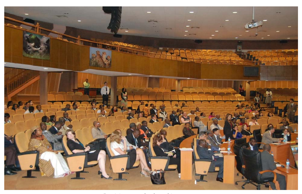
Participants at the launching ceremony