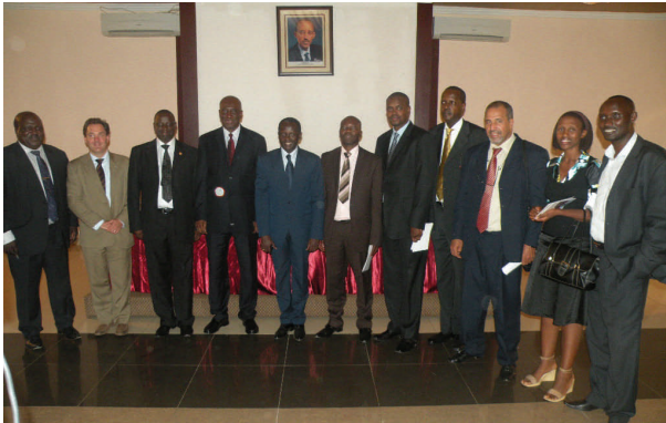
A group picture after the hand-over ceremony.

The ICTR Prosecutor pointed out that the process had taken many years, but with perseverance, patience and commitment and the support of International Donors, who contributed to the Capacity Building of the Rwandan Justice System, a major achievement has been registered. This, he said, was an important aspect in fighting impunity in Rwanda and in the region and a major component in the Tribunal's Completion Strategy.