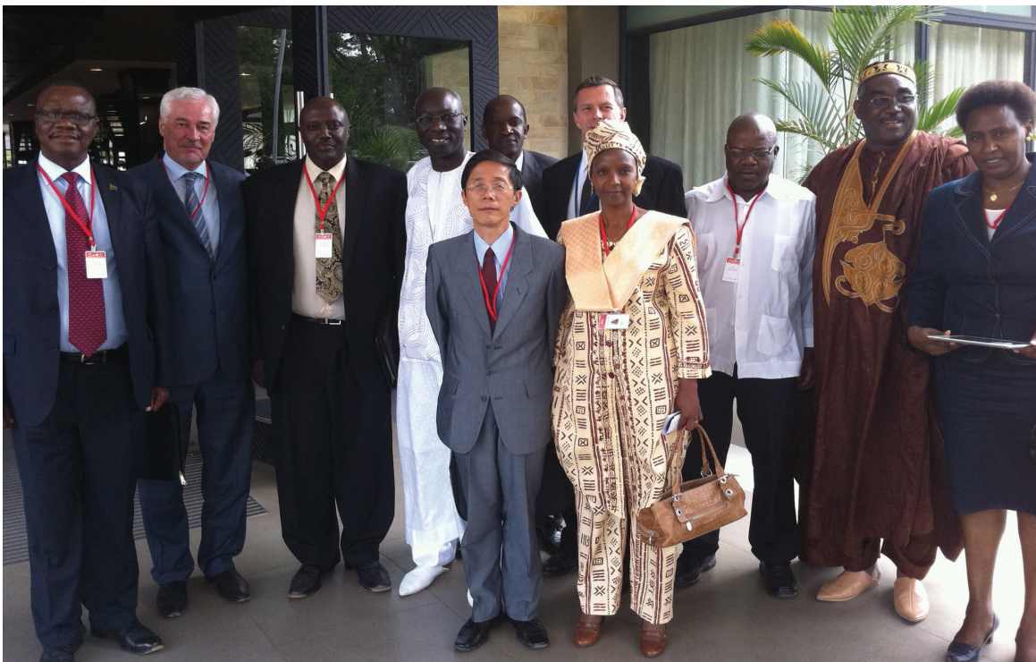
The Ambassadors and High Commissioners pictured together with the Registrar of the ICTR Mr. Adama Dieng (fourth left) .