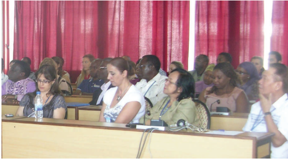
ICTR staff members attending the Town Hall Meeting

approved the Tribunal's budget for 2012-2013 as requested by ICTR management. However, ICTR staff should be prepared to work more with less funding, which implies being ready for "multi-tasking by doing more than we are currently doing" due to "the notable increase in the workload", urged the Registrar.