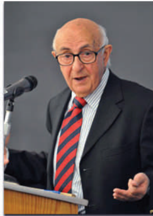
Judge Theodor Meron of the United States appointed President of the Residual Mechanism