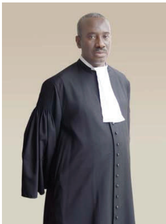
Mr. Hassan Bubacar Jallow from Gambia, appointed Prosecutor of the Residual Mechanism

Judge Meron and Mr. Jallow are eminently qualified for the respective positions of President and Prosecutor of the Mechanism. The Secretary-General believes that the Mechanism will benefit immensely from their considerable experience, outstanding leadership skills, and profound commitment to international criminal justice.